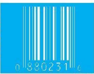
Image Type: Other Actual Dimensions: 1.25 inches W X 0.75 inches H

GOVERNMENT WARNING: (1) ACCORDING TO THE SURGEON GENERAL, WOMEN SHOULD NOT DRINK ALCOHOLIC BEVERAGES DURING PREGNANCY BECAUSE OF THE RISK OF BIRTH DEFECTS. (2) CONSUMPTION OF ALCOHOLIC BEVERAGES IMPAIRS YOUR ABILITY TO DRIVE A CAR OR OPERATE MACHINERY, AND MAY CAUSE HEALTH PROBLEMS.