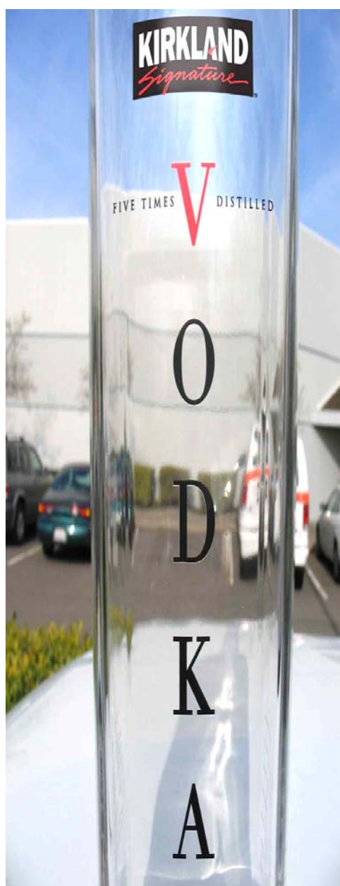
Image Type: Brand (front) Actual Dimensions: 2.31 inches W X 2.62 inches H

Image Type: Brand (front) Actual Dimensions: 2.5 inches W X 6.53 inches H