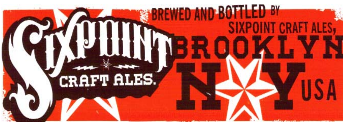
Image Type: Brand (front) Actual Dimensions: 6 inches W X 4 inches H

GOVERNMENT WARNING: (1) According to the Surgeon General, women should not drink alcoholic beverages during pregnancy because of the risk of birth defects. (2) Consumption of alcoholic beverages impairs your ability to drive a car or operate machinery, and may cause health problems.