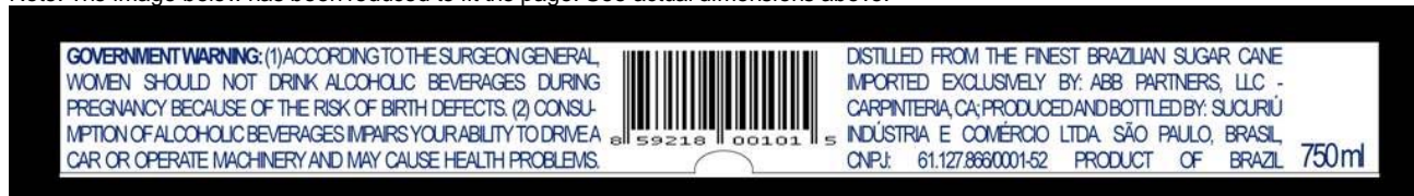
Image Type: Strip Actual Dimensions: 1.2 inches W X 5.77 inches H

Note: The image below has been reduced to fit the page. See actual dimensions above.