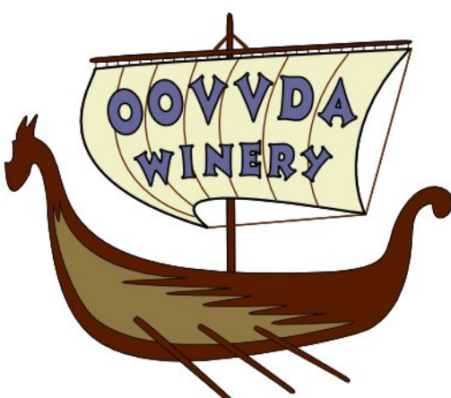
Image Type: Brand (front) Actual Dimensions: 4 inches W X 3.33 inches H