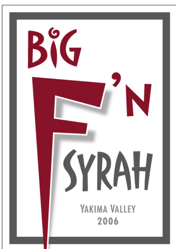
Image Type: Brand (front) Actual Dimensions: 3.25 inches W X 4.50 inches H

AFFIX COMPLETE SET OF LABELS BELOW Image Type: Back Actual Dimensions: 3.25 inches W X 4.50 inches H