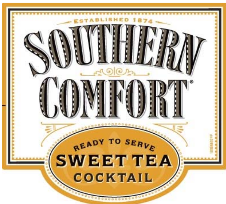
Image Type: Other Actual Dimensions: 06.00 inches W X 03.35 inches H

AFFIX COMPLETE SET OF LABELS BELOW Image Type: Brand (front) Actual Dimensions: 04.00 inches W X 03.60 inches H