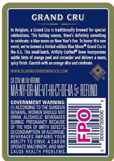
Image Type: Strip Actual Dimensions: 0.58 inches W X 4.64 inches H