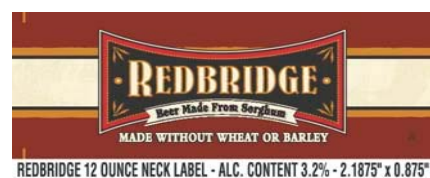
REDBRIDGE 12 OUNCE NECK LABEL - ALC. CONTENT 3.2% - 2.1875" x 0.875"

Actual Dimensions: 2.18 inches W X .87 inches H