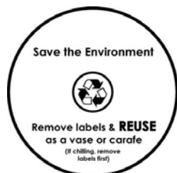
Image Type: Other Actual Dimensions: 1.25 inches W X 1.25 inches H