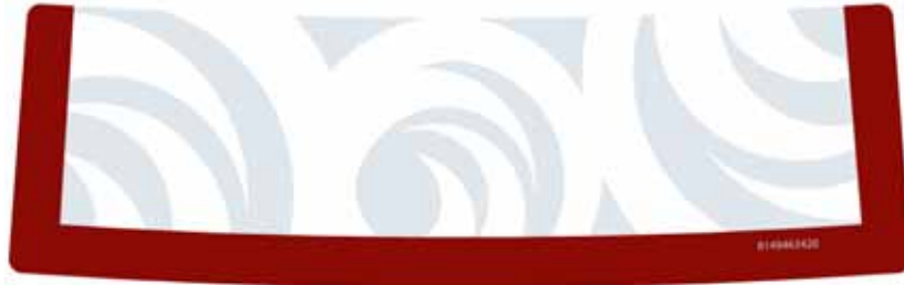
Image Type: Neck

Actual Dimensions: 4.23 inches W X 1.4 inches H