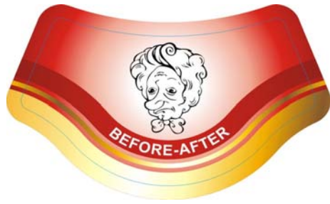
Image Type: Brand (front)

Actual Dimensions: 2.36 inches W X 1.42 inches H