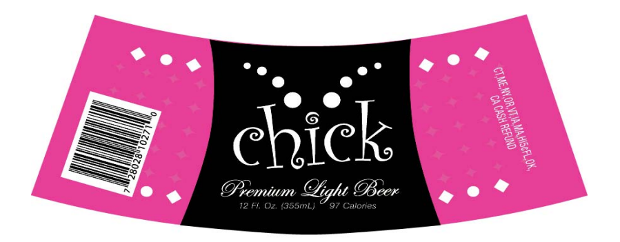
Image Type: Brand (front) Actual Dimensions: 3.81 inches W X 3.25 inches H

Image Type: Neck Actual Dimensions: 4.19 inches W X 1.73 inches H