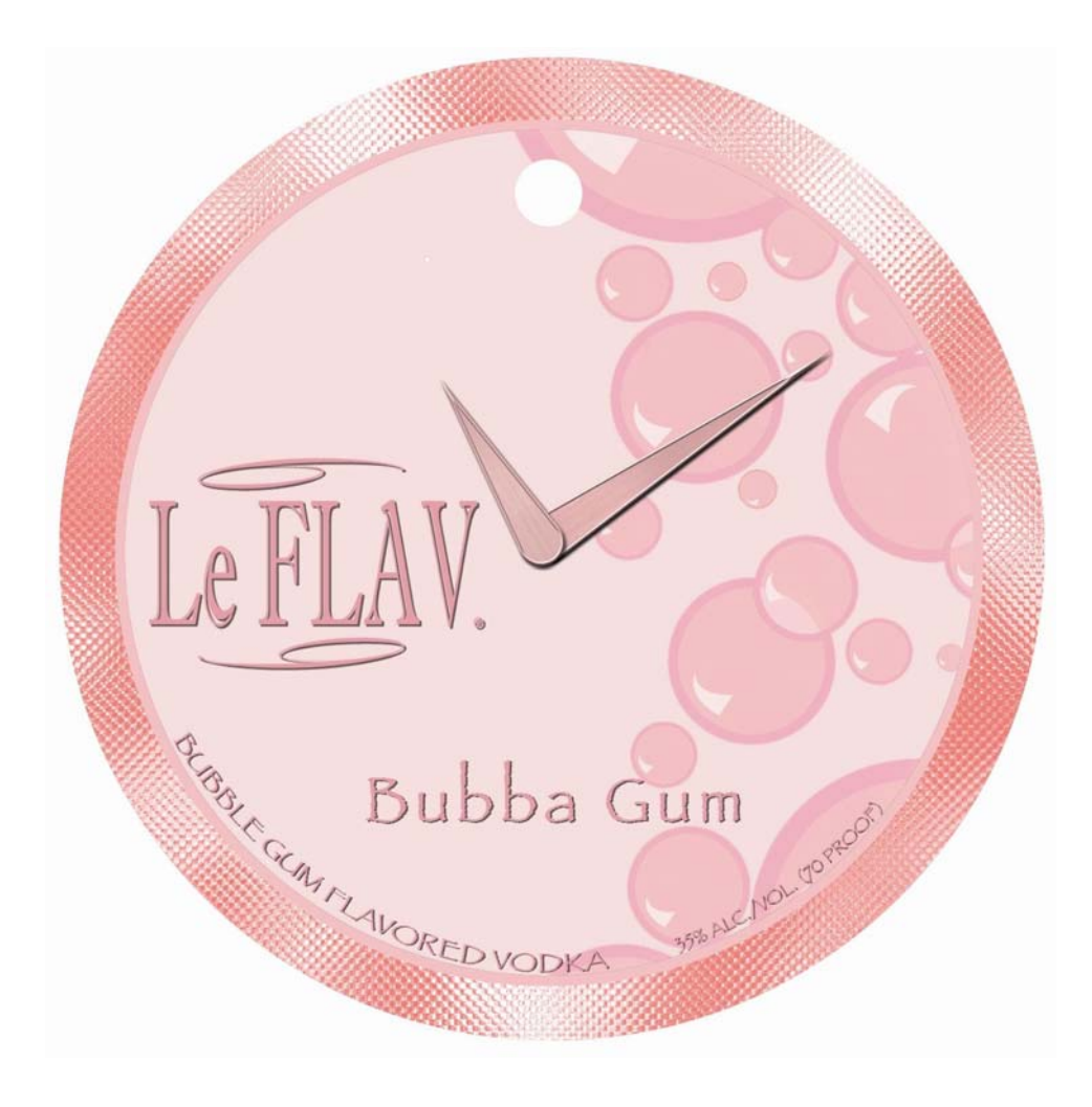
Image Type: Brand (front) Actual Dimensions: 5.0 inches W X 5.0 inches H